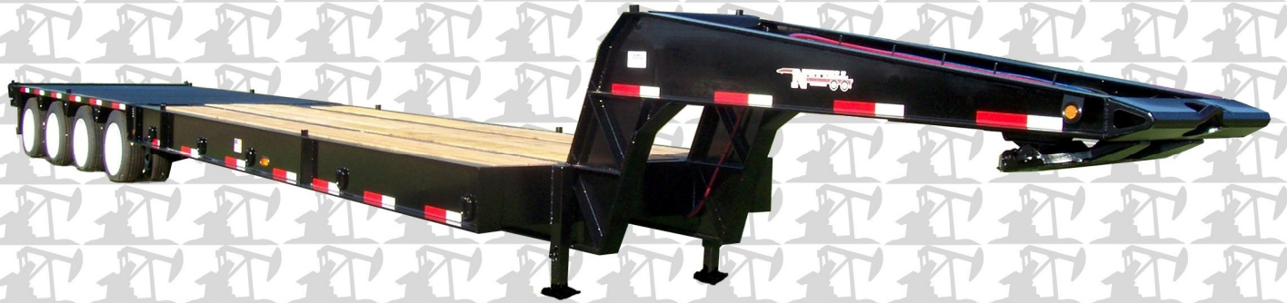
4 AXLE 60 TON SHOWN

2, 3 & 4 AXLE CONFIGURATIONS AVAILABLE IN 35 TO 60 TON CAPACITIES