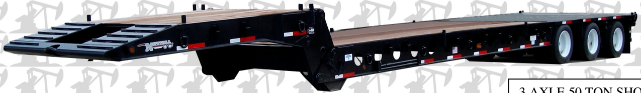
3 AXLE 50 TON SHOWN

2, 3, 4 & 5 AXLE MODELS AVAILABLE IN 35 to 70 TON CAPACITIES