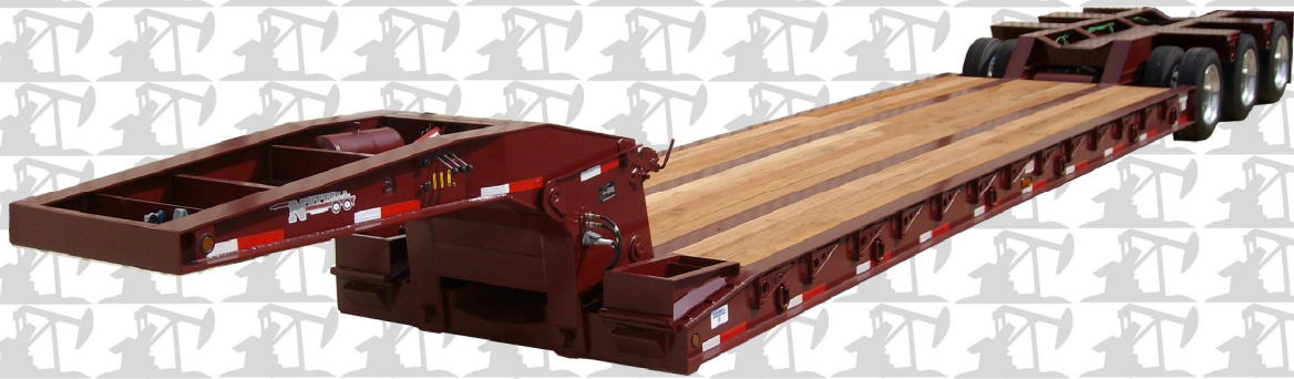
3 AXLE 51 TON SHOWN

2 AND 3 AXLE MODELS AVAILABLE IN 35 TO 60 TON CAPACITIES